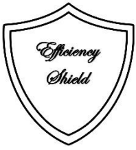
Hereford Times Efficiency Shield