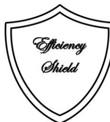
Hereford Times Efficiency Shield